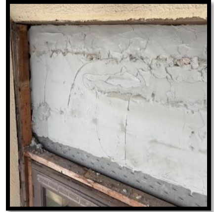
Picture's showing the SFS and EPDM, installed to phase 1