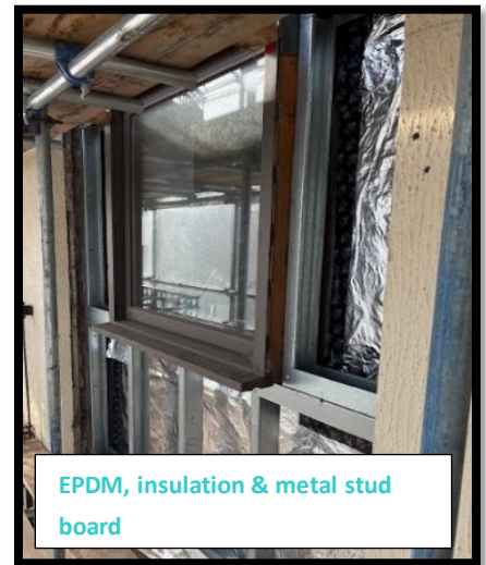
EPDM, insulation & metal stud board