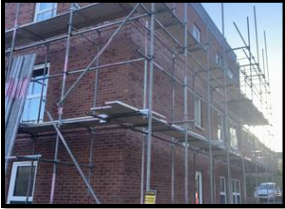
Phase 1 Vellum House Scaffold

A photo showing scaffold erection progress.