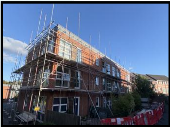
Phase 1 Vellum House Scaffold

A photo showing scaffold erection progress.