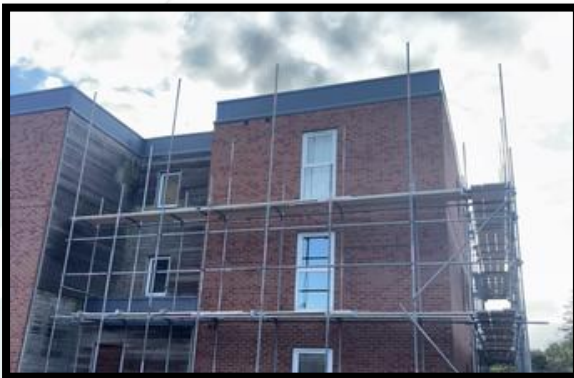
Phase 1 Vellum House Scaffold

A photo showing scaffold erection progress.