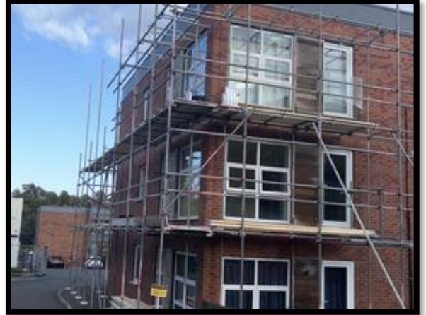
Phase 1 Vellum House Scaffold

A photo showing scaffold erection progress.