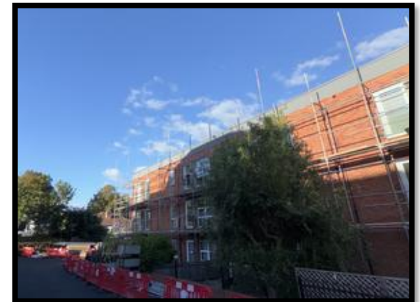
Phase 1 Vellum House Scaffold

A photo showing scaffold erection progress.