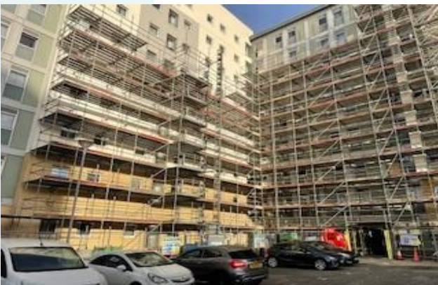
Phase 2 Scaffolding ongoing.