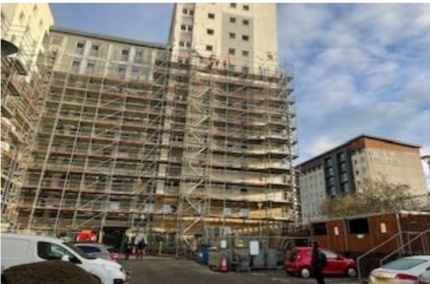
phase 1 scaffolding ongoing