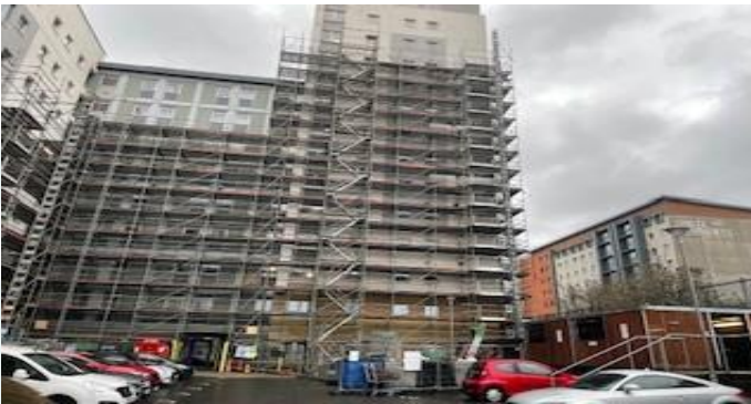
phase 1 scaffolding ongoing