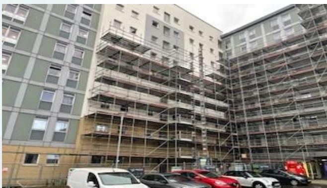
Phase 2 Scaffolding ongoing

Phase 1 and 2 scaffolding is still ongoing and will continue this week. For your safety do not climb on the scaffolding.